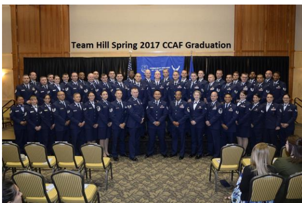
April 2017 CCAF Graduation Class (49 Graduates)